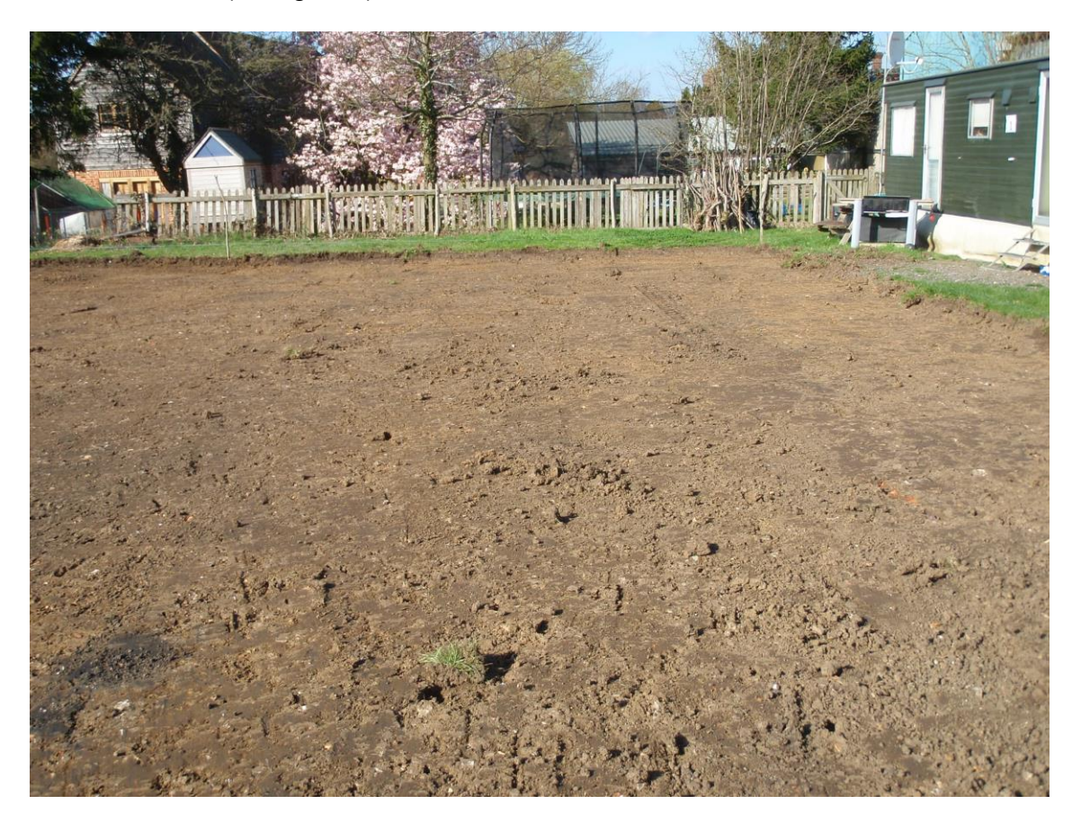
Plate 3. View of site (looking NE)