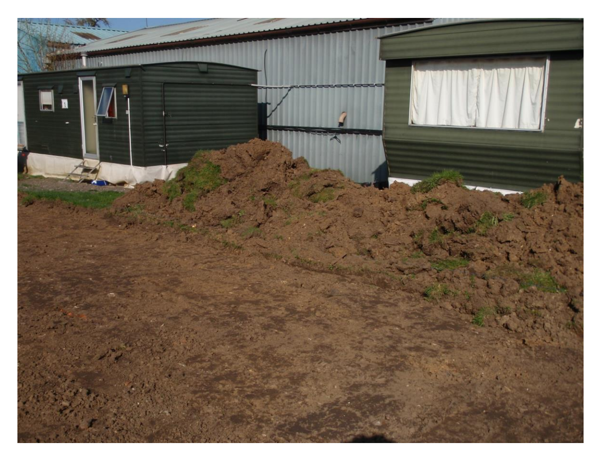
Plate 4. View of site (looking east)