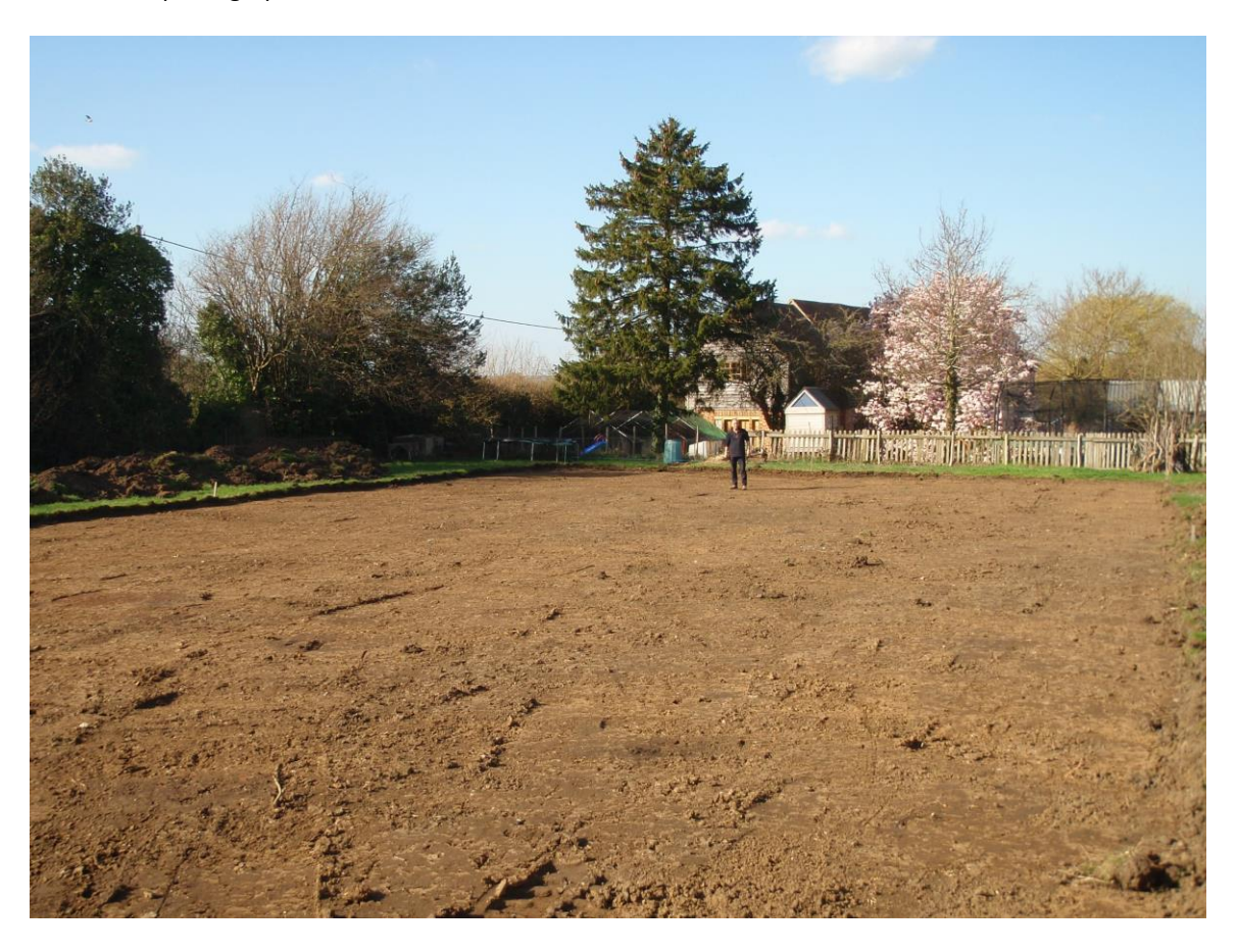
Plate 1. View of site (looking NNW)