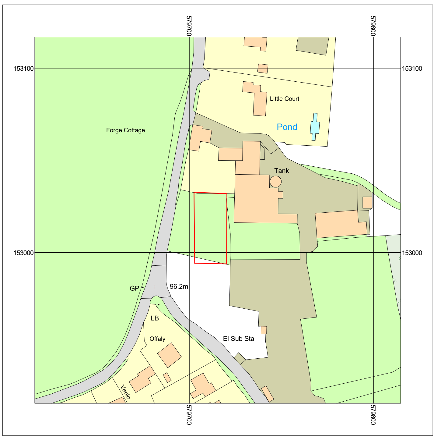
Figure 1 Site location