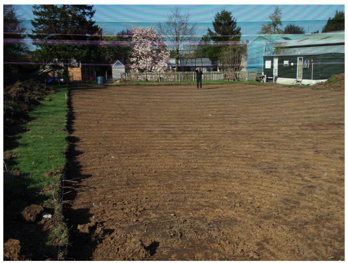
Plate 2. View of site (looking north)