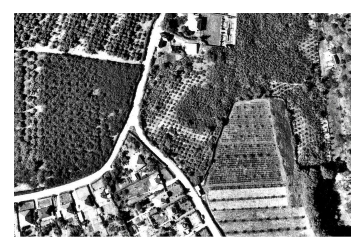
AP 2. Aerial photograph c.1960