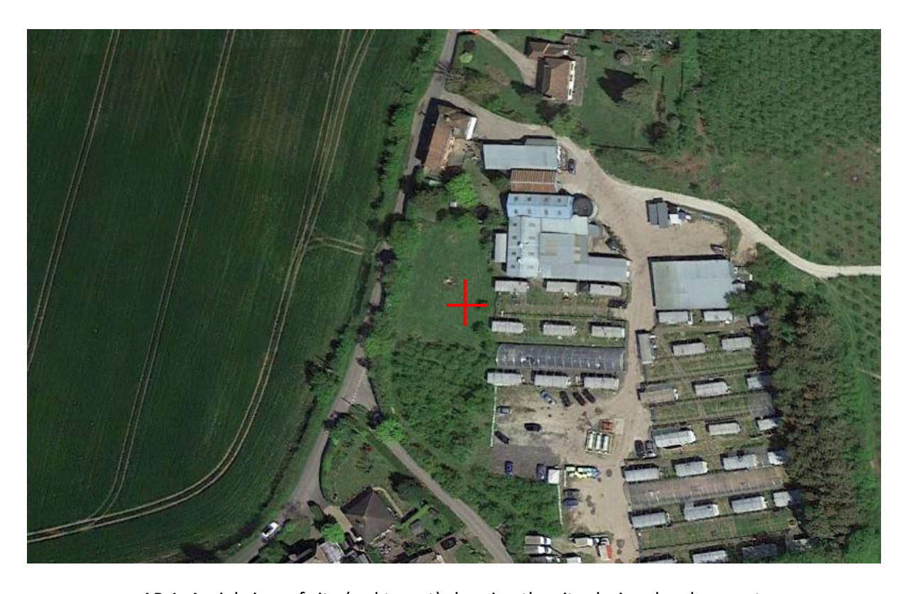
AP 1. Aerial view of site (red target) showing the site during development.